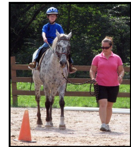
The program for children with Autism, funded by a grant through Summit Endowment, finished its second year of data collection.