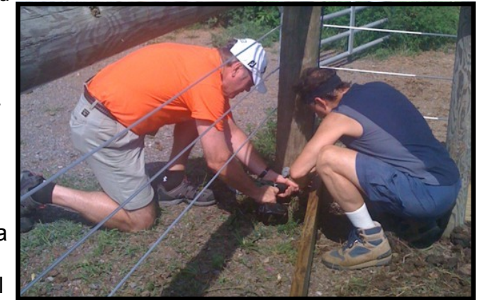
Two members of the Chambersburg Rotary volunteers work to install the herb garden portion of the new sensory trail.

May 22 was a busy day as it was also the United Way's May Day of Caring at the Riding Center. About 20 people from the Chambersburg Hospital and Fetterhoff Chapel Church spent the day at the Riding Center getting it spruced up for the season. They painted the entrance door and door frame as well as the tack room door. They cleaned the entryway, laundry room, tack room and office, even washing and waxing the floors. They also cleared out dust and cobwebs in the barn by wiping down the bars on the stalls. Outside, individuals built fence behind the indoor arena and mowed weeds around the holding pond.