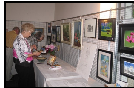
Bidders keep an eye on their favorite art pieces.

Finally, a newly formed Council took shape which will provide proper financial oversight as well as ensure that everyone is working towards our mission and vision. The Operations Committee is now an active group that focuses on the overall maintenance and management of the facility. With everyone working together, we can continue to hold lessons and programs that help others in our community.